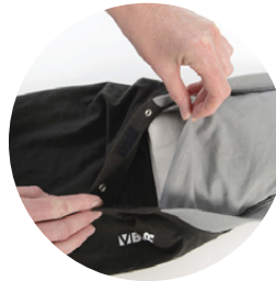
Double fabric under abdomen